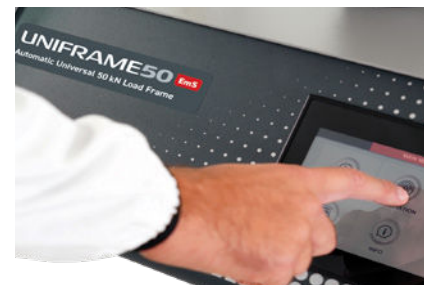
Detail of the 7" touchscreen display