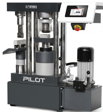
PILOT PRO mod.65-L27P12