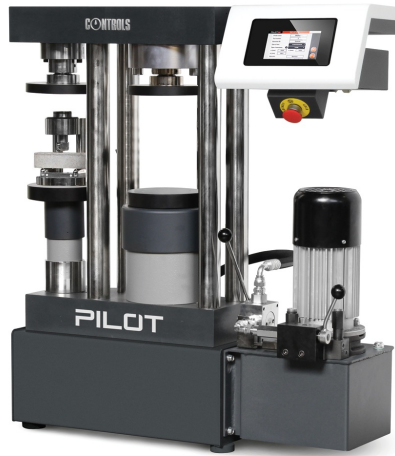
PILOT PRO mod.65-L28P12