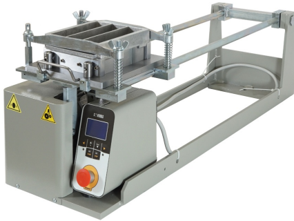
Jolting apparatus model 65-L0012/G