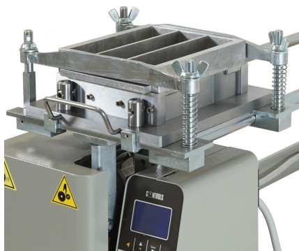
Detail of the system for quick locking of the mould