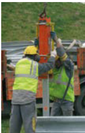
PAJOT HAMMERS 160 on PAJOT GUARDRAIL POST PILE DRIVER PR108